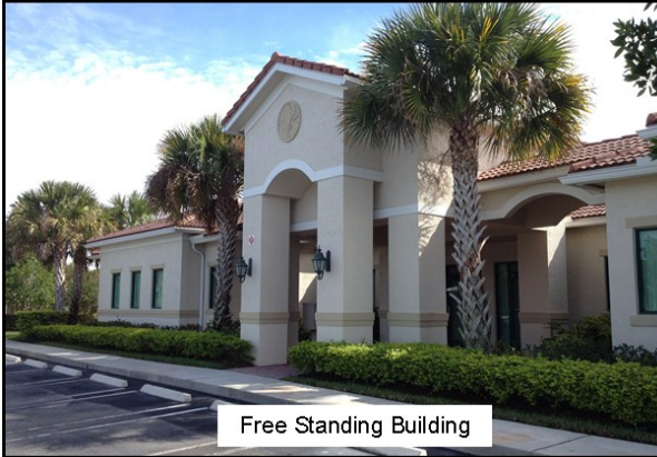
Free Standing Building